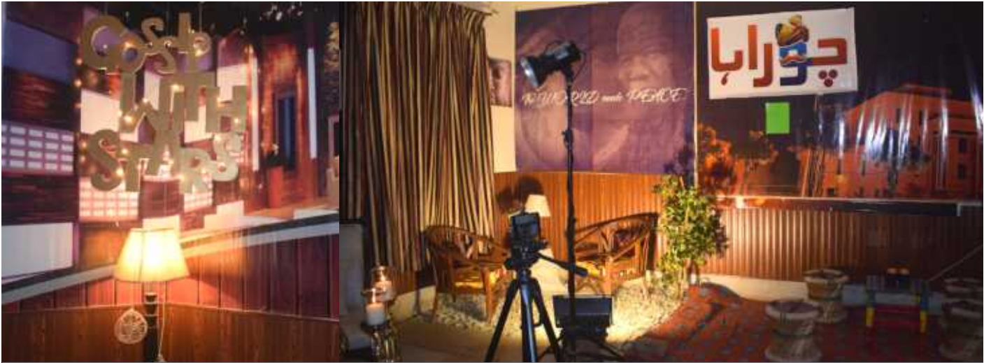
A view of studio projects designed by the students of Communication and Media Studies

Students of the Department of Communication and Media Studies were imparted skills to produce documentaries using smartphones and to pursue career in the multifaceted field of media production.