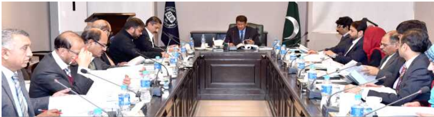
The Vice Chancellor presiding over the Academic Council meeting

T he University of Sargodha has revised semester and admission regulations to bring them on par with the prevailing regulations in national universities as per the guidelines and recommendations of Higher Education Commission.