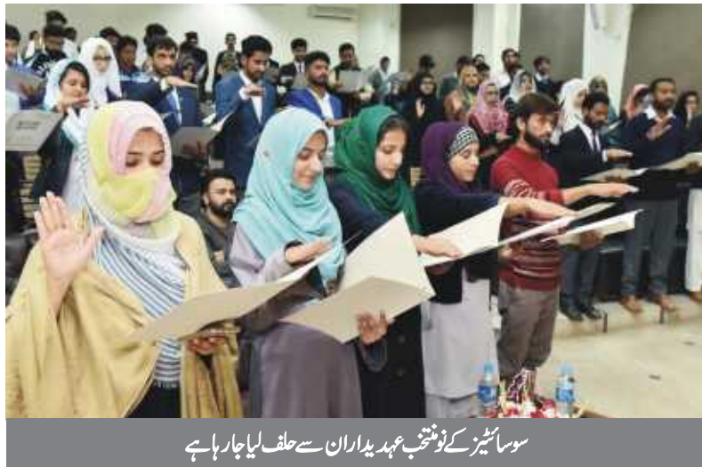
سوسائٹیز کے نو منتخب عہدیداران سے حلف لیا جا رہا ہے

چانسلر نے 18 طلبہ سوسائٹیز کے عہدیداران سے حلف لیا، سوسائٹیز میں ادبی، تخلیقی، سپورٹس، ایڈوینچر، میوزک، تحریر و تقریر، آئی ٹی، ڈرامہ، قرات و نعت، شعر و شاعری، ای گیمز، کمیونٹی سروس، گرین سوسائٹی کے علاوہ دیگر سوسائٹیز شامل ہیں۔