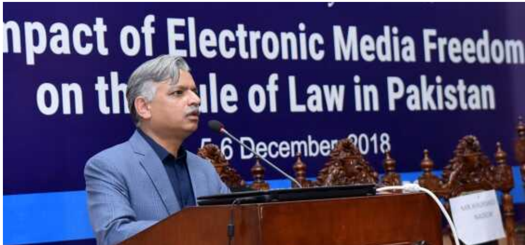
Khursheed Nadeem, renowned writer and TV celebrity, addressing the national conference

A two-day national conference emphasizing the constructive role of judiciary as well as electronic media for smooth running of democracy and rule of law held at Sargodha University on 5-6 December 2018.