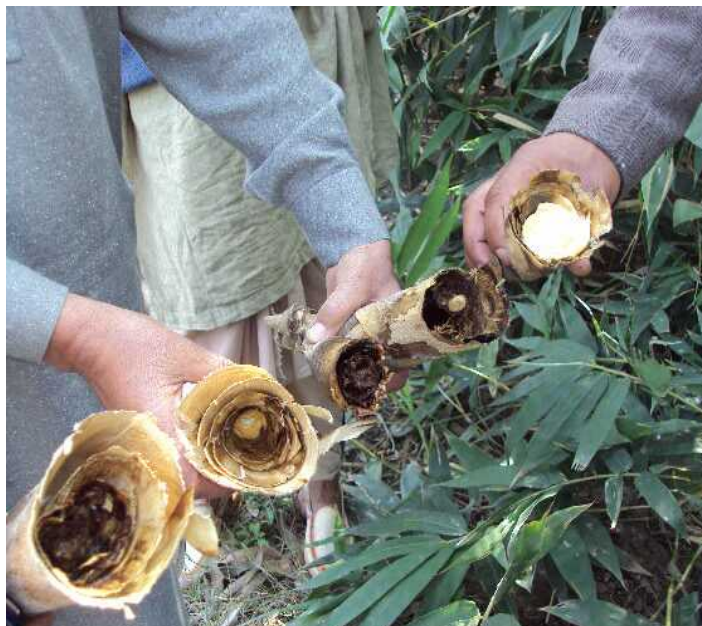
Probing the problems of bamboo cultivation in the Sargodha region

The sole purpose behind all these activities is to involve the agriculture scientists to get first hand knowledge of the problems of the farmers and try to solve them in the field and give them