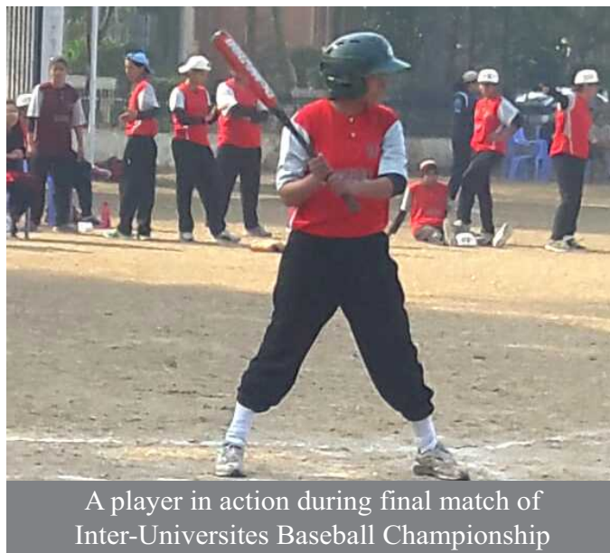
A player in action during final match of Inter-Universities Baseball Championship

“We could not win the trophy but we are happy that we gave our best