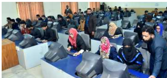
Students taking MS Office Certification exam

Addressing the session, Senator Rukhsana Zuberi, President of TEC Education Foundation and former chairperson Pakistan Engineering Council, said that technical skills are a great way for graduates to give themselves the competitive edge over other candidates. The Senator briefed the students about the MS Office Certification program that normally it costs around $100 for each module (Office, Power Point and Excel) but HEC, in collaboration