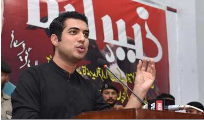
ٹی وی اینکر سید اقرار الحسن

نے کہا کہ کلین اینڈ گرین پروگرام کو کامیاب بنانے کے لیے اجتماعی سوچ اپنانے کی ضرورت ہے، ماحولیاتی آلودگی کے خاتمہ کے لیے ضروری ہے کہ پلاسٹک بیگز کا استعمال ترک کیا جائے، نامیاتی کچرے کو ضائع کرنے کے بجائے توانائی کے حصول و دیگر مقاصد کے لیے استعمال میں لایا جائے اور بڑے پیمانے پر شجرکاری مہمات کا آغاز کیا جائے تاکہ آئندہ نسلوں کا مستقبل محفوظ بنایا جاسکے۔ اس موقع پر طلباء و طالبات نے اپنے ملک کو صاف ستھرا رکھنے کے قومی فریضہ کو بخوبی نبھانے کے عزم کا اعادہ کیا۔