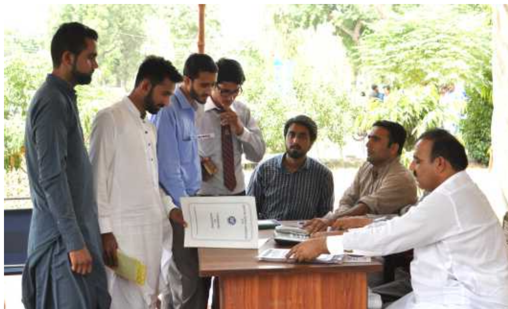
Students of the PPP sub-campuses being facilitated at the facilitation centre set up at the main campus

Students of these private sub-campuses have been facing uncertainty as the managements of Lahore and Mandi Bahauddin sub-campuses were in the custody of the National Accountability Bureau, while the women's and Lyallpur sub-